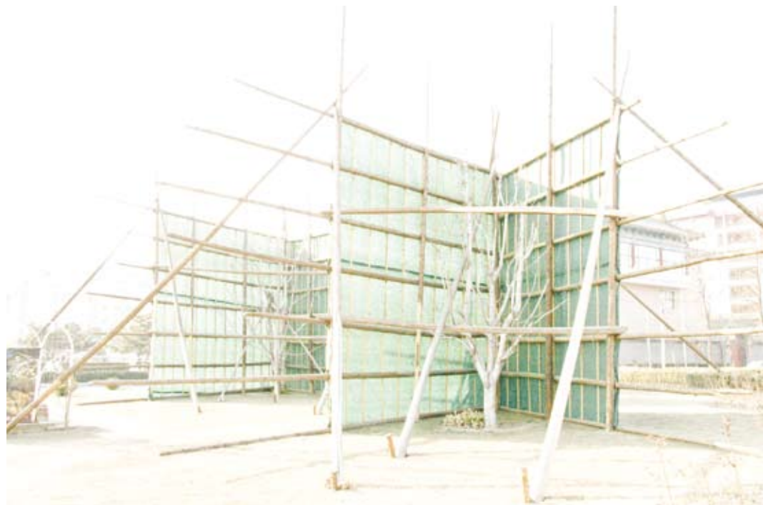
Jayne Dyer 简·戴尔 Greening 绿化, 2008, Digital image 电子图片, 53x80cm