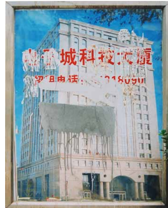
Tony Scott / Huang Xu Beijing realestate 24, 2006 digital image edition 5, 100 x 80 cm