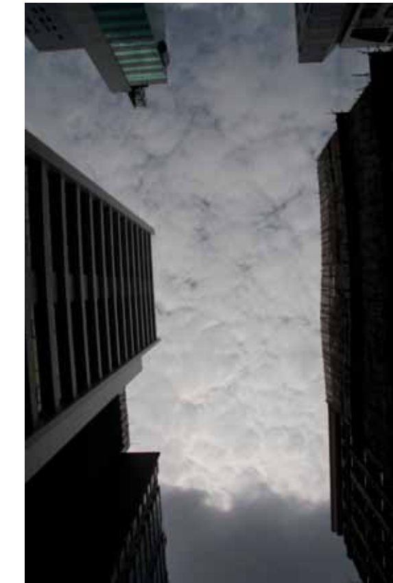
Jayne Dyer The old world's new world 3, 2010 photograph edition 5, 30 x 20 cm