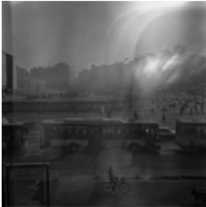
Hu Qinwu Beijing: Beijing 2, 2009 digital print edition 5, 90 x 90 cm