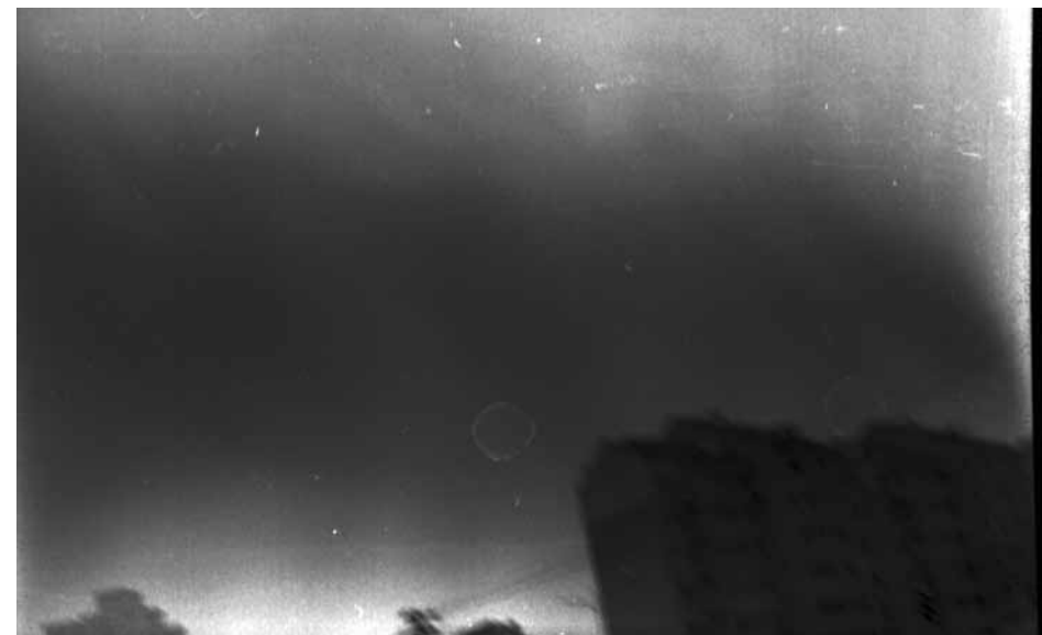
Hu Qinwu Beijing: Beijing 2, 2009 digital print edition 5, 90 x 90 cm