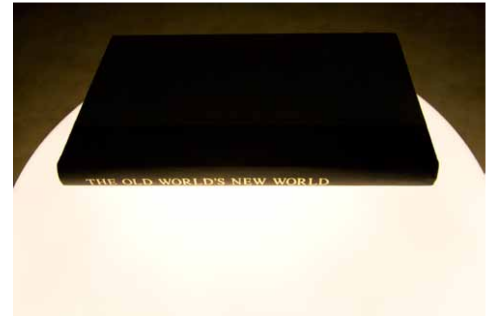
Jayne Dyer The old world's new world 5, 2010 photograph edition 5 20 x 30 cm