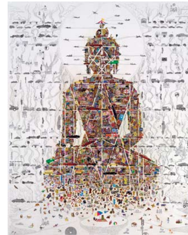
Gonkar Gyatso Buddha in our time 2010 85 x 68cm Silk screen print