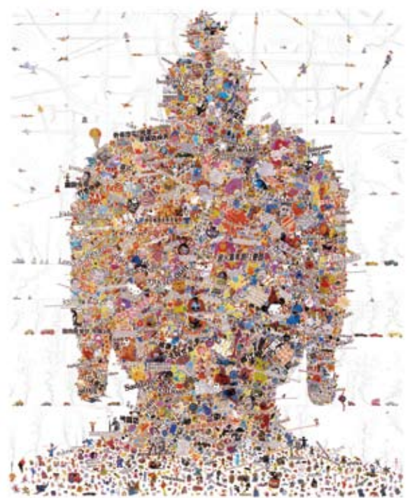
Gonkar Gyatso Summer Buddha 2010 85 x 66.5cm Silk screen print