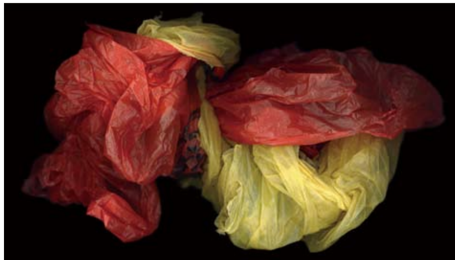
Fragment No.26 碎片26, 2007 photograph照片, 57x100cm(12 edition), 120x215cm(6 edition)