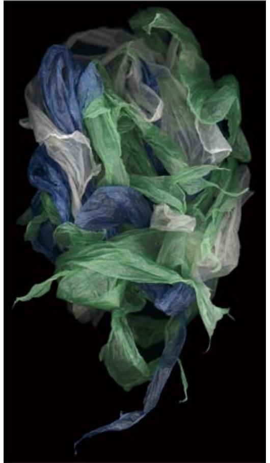
Fragment No.30 碎片30, 2007 photograph照片, 57x100cm(12 edition), 120x215cm(6 edition)