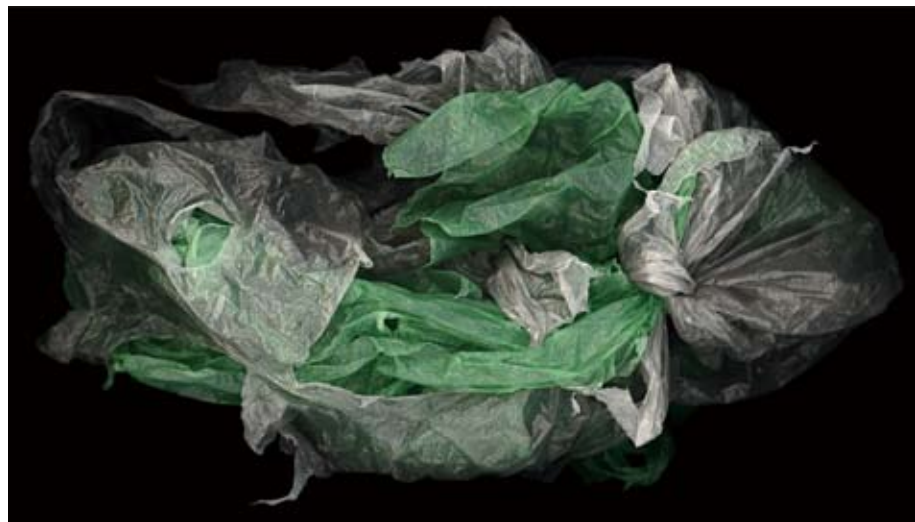
Fragment No.28 碎片28, 2007 photograph照片, 57x100cm(12 edition), 120x215cm(6 edition)