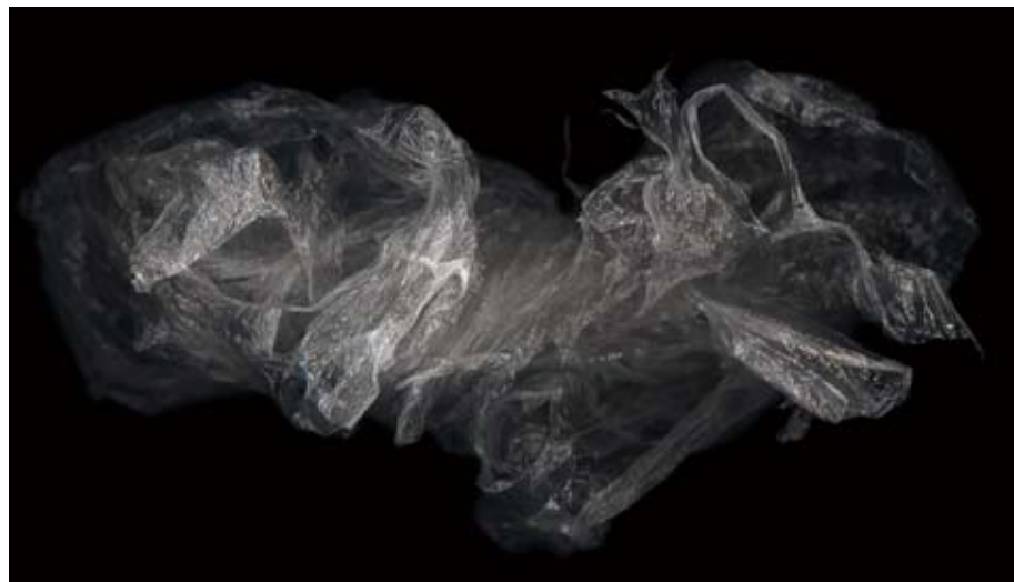
Fragment No.27 碎片27, 2007 photograph照片, 57x100cm(12 edition), 120x215cm(6 edition)