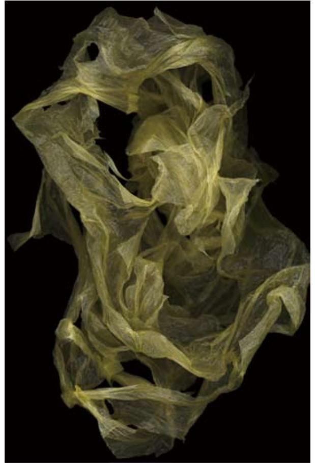
Fragment No.3 碎片3 , 2007 photograph照片, 66x100cm(12 edition), 122x182cm(6 edition)