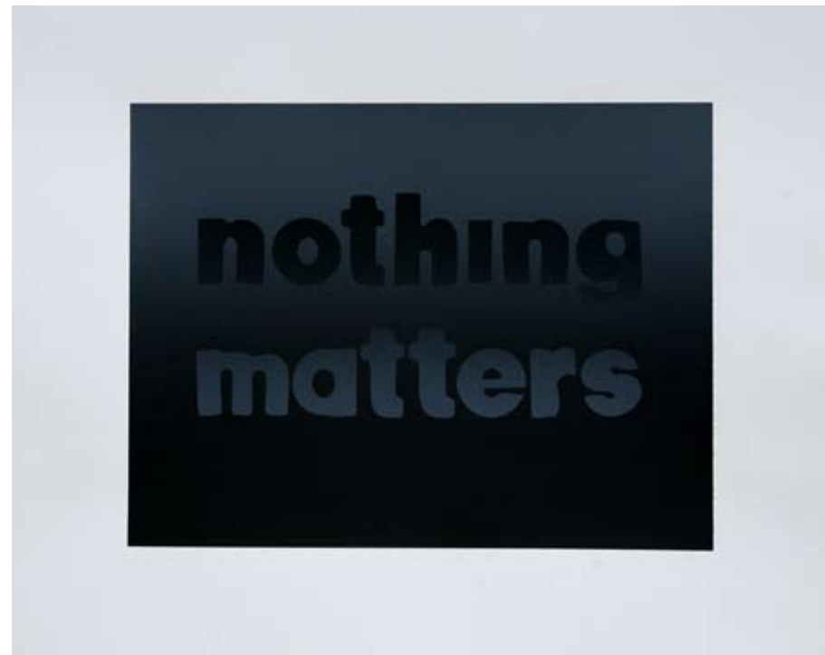
Nothing Matters , 2008 silk-screen, edition of 13 26 x 39cm