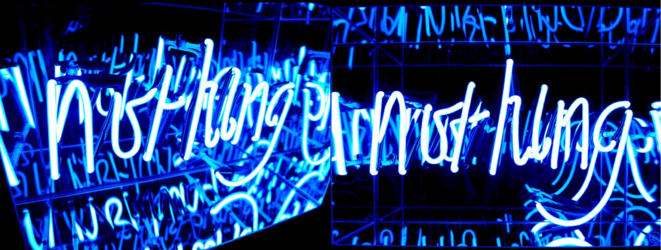
Infinite Nothing Neon , 2008