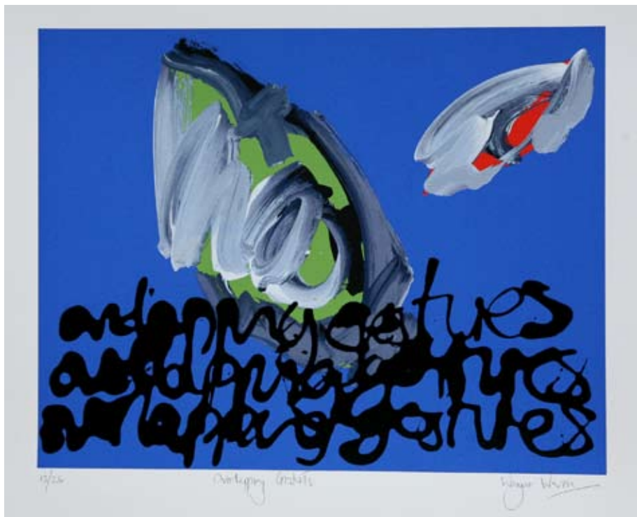
Overlapping Gestures , 2006 silk-screen, edition of 26 54 x 63cm