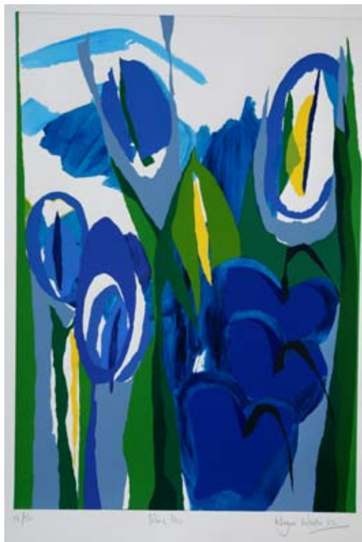
Dido's Iris , 2002 silk-screen, edition of 50 81 x 61cm