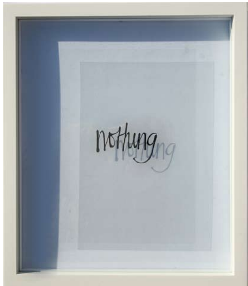
Nothing , 2007 acrylic on acetate, framed 43 x 36cm