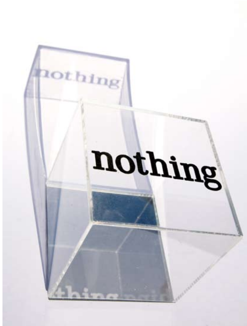
Nothing Box , 2006 perspex mirror and paper unique piece 13.5 x 13.5 x 13.5cm