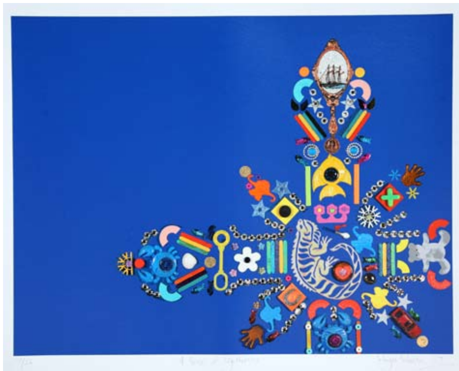
A Sense of Togetherness , 2007 silk-screen, edition of 26 61 x 75cm