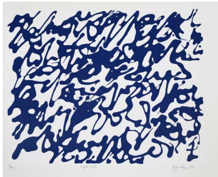
Unspoken Words , 2006 silk-screen, edition of 26 66 x 72cm