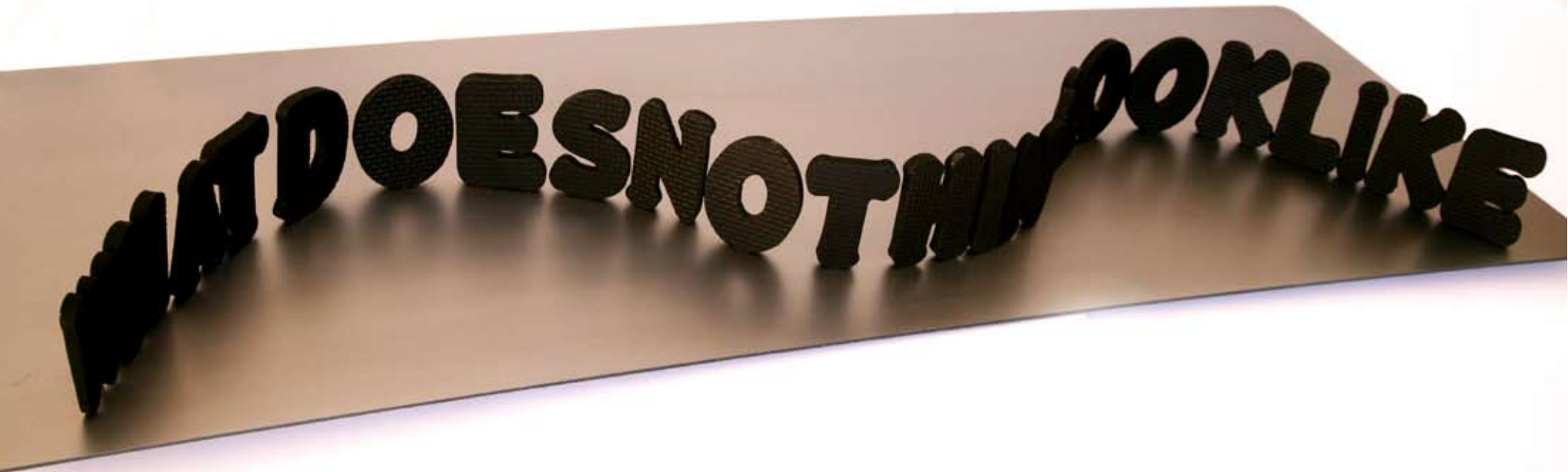
What Does Nothing Look Like Snaked , 2006 resin magnets and steel 100 x 20 x 5cm