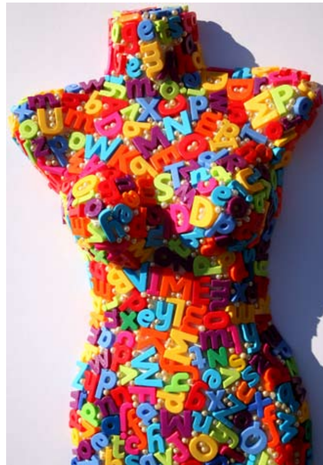
Woman's Needs , 2006 foam letters on plastic mannequin 70 x 43 x 14cm