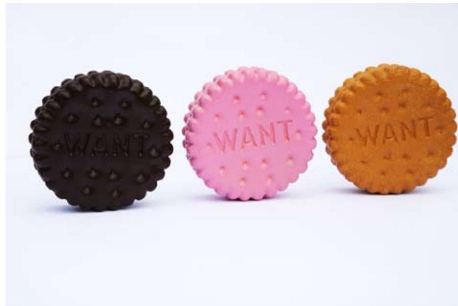
Biscuits , 2009 (WANT side) painted resin, 8 sets of 3 diametre: 8cm