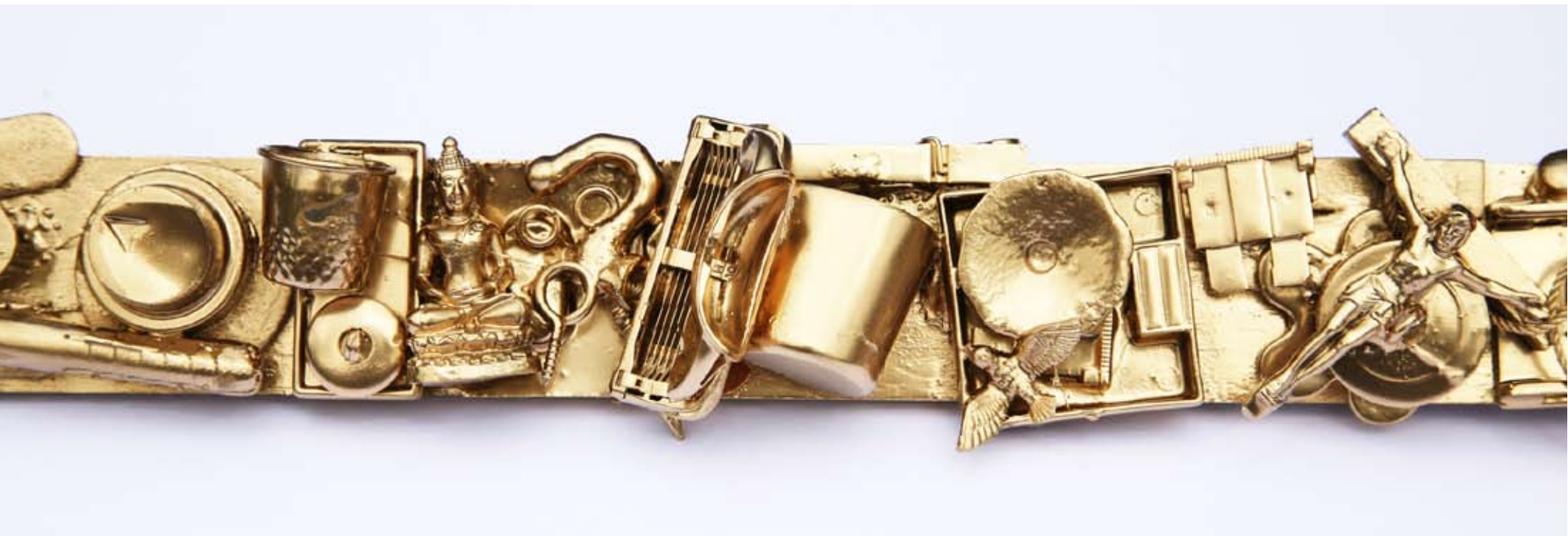
Adding two inches , 2009 plastic, metal, wood, paint 2" x variable length