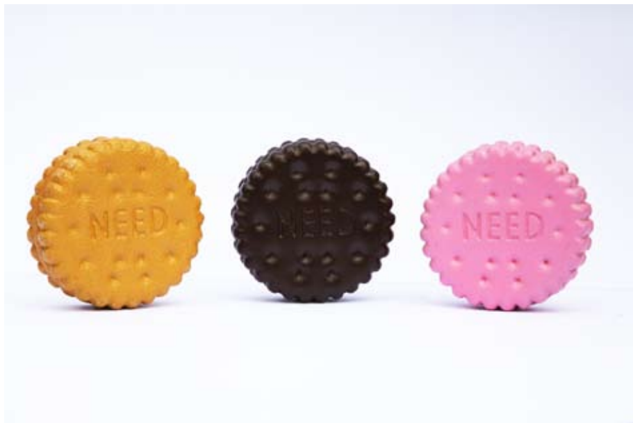
Biscuits , 2009 (NEED side) painted resin, 8 sets of 3 diametre: 8cm