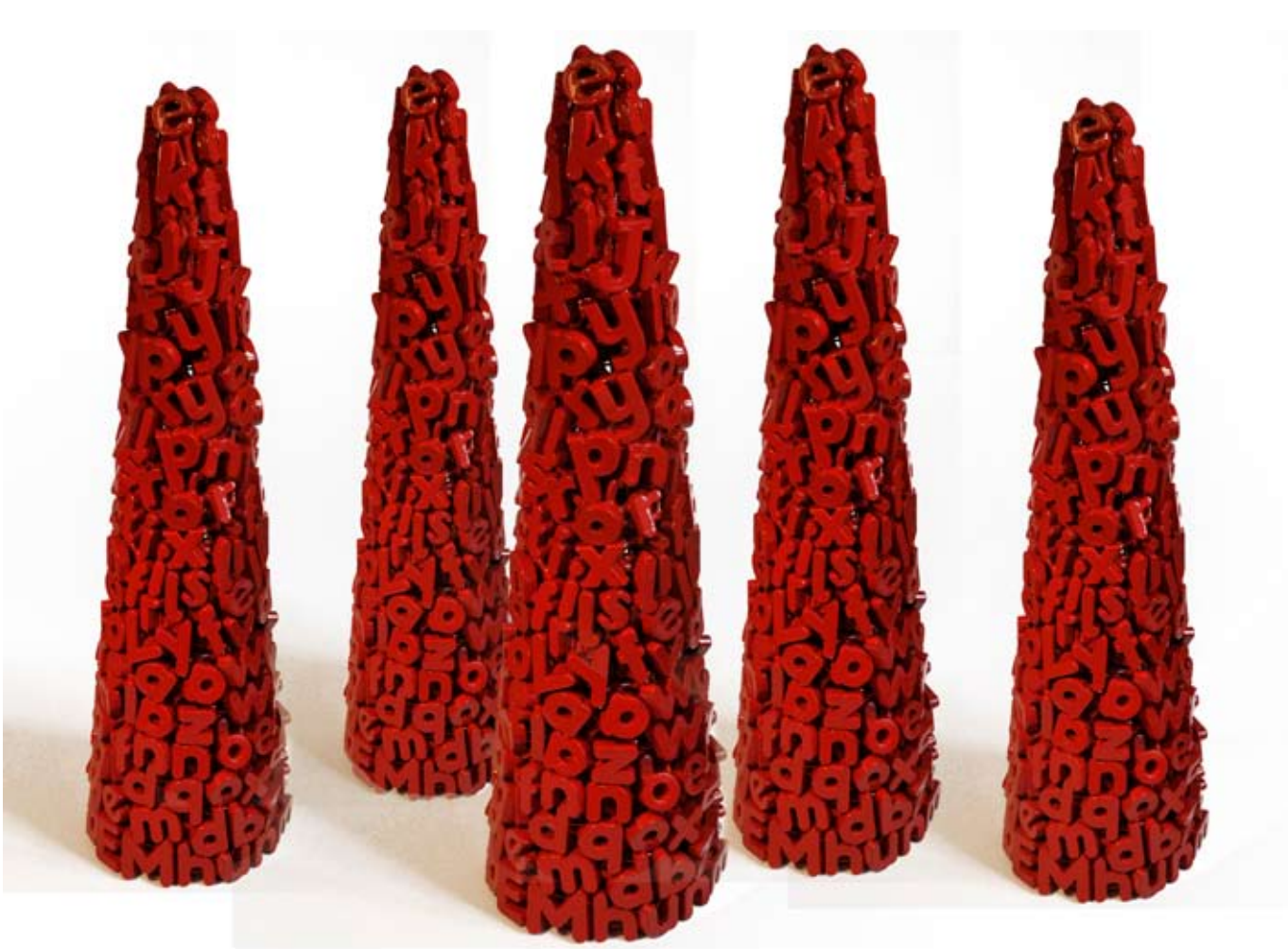
Red Towers – project, 2008 plastic paint on metal 15 x 13cm