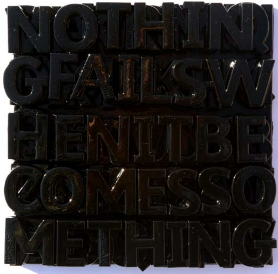
Nothing fails , 2007 bronze 26 x 24cm