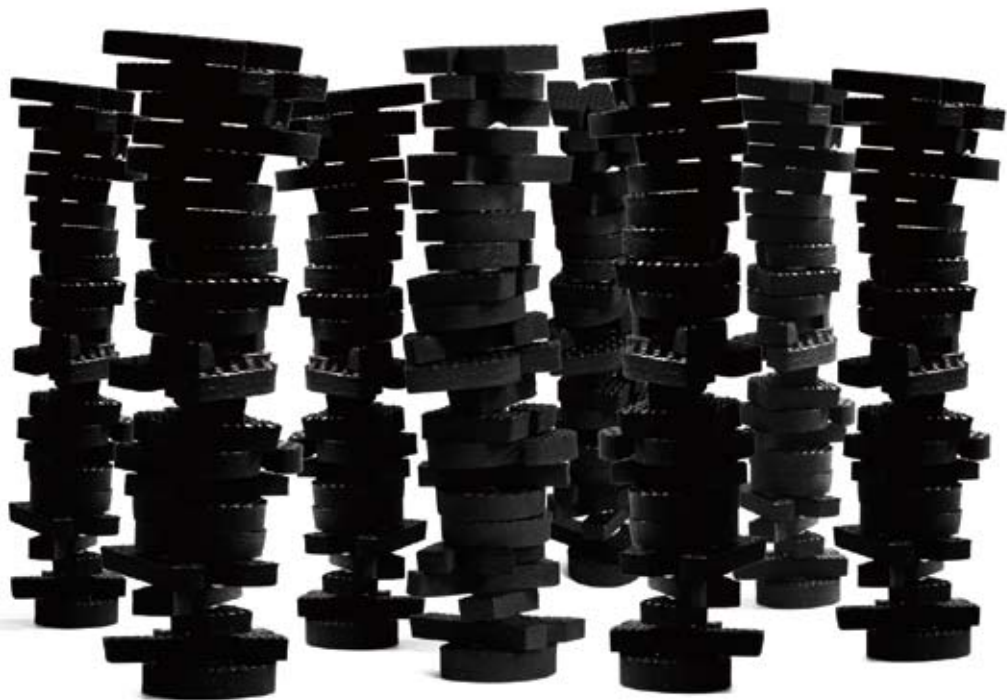
What Does Nothing Look Like Word Tower – Project, 2006 original single sculpture bronze 23 x 5cm