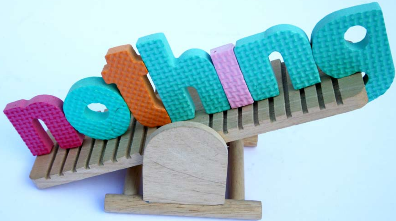
What Does Nothing Weigh , 2006 foam letters on wood 15 x 10 x 6cm