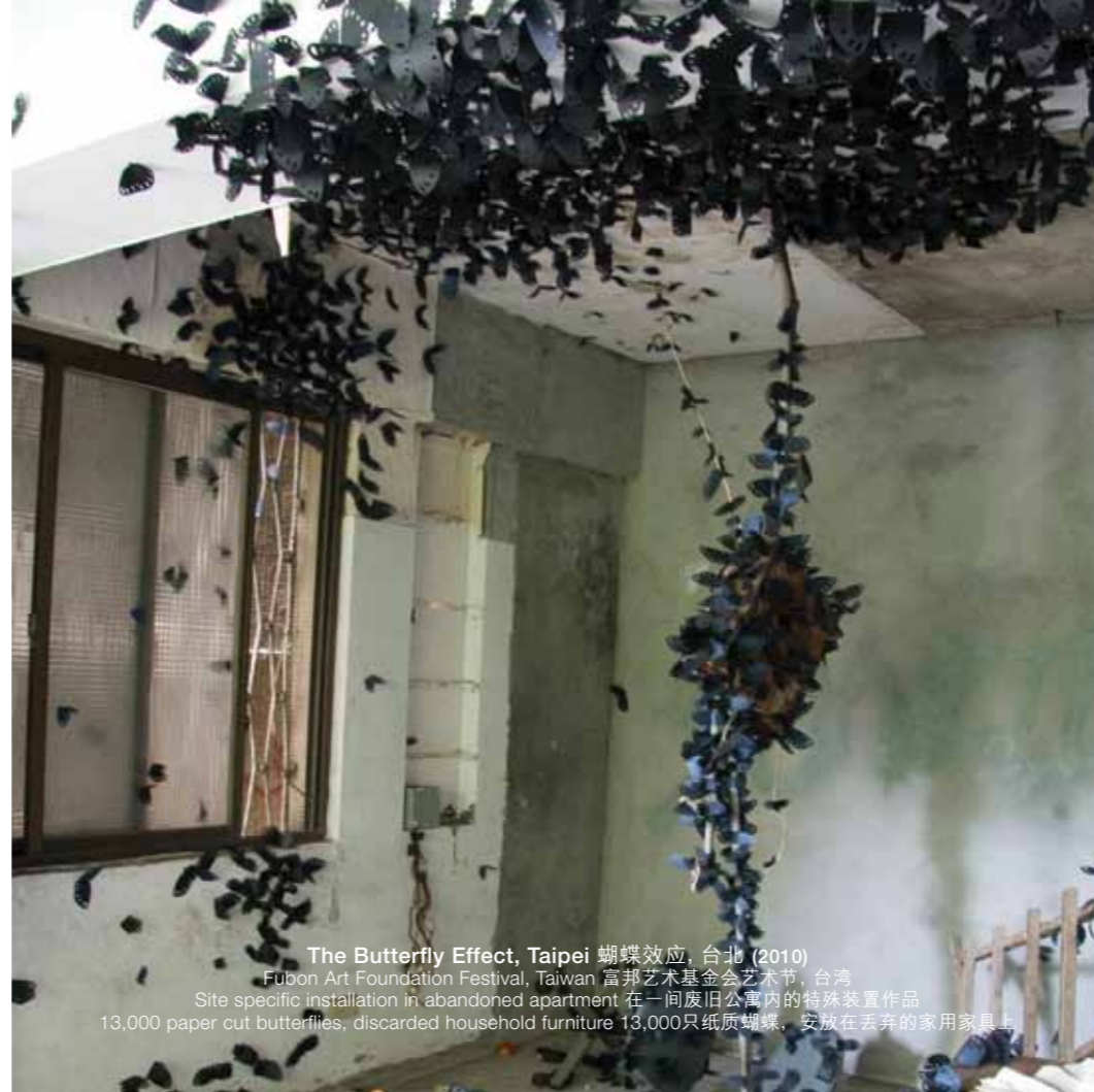
The Butterfly Effect, Taipei 蝴蝶效应, 台北 (2010) Fubon Art Foundation Festival, Taiwan 富邦艺术基金会艺术节, 台湾 Site specific installation in abandoned apartment 在一间废旧公寓内的特殊装置作品 13,000 paper cut butterflies, discarded household furniture 13,000只纸质蝴蝶, 安放在丢弃的家用家具上